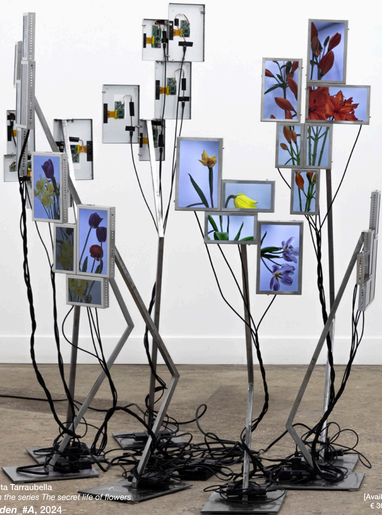
Julieta Tarraubella From the series The secret life of flowers Garden #A, 2024